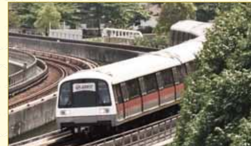
Ang Mo Kio, Buangkok and Hougang MRT Stations